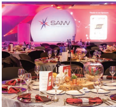
SAIW Awards – Quick View ... Pg 5