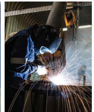
A Career in Welding ... Pg 10