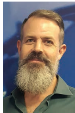
In the Spotlight ... Pg 8