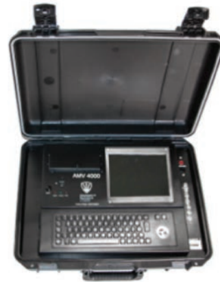
Fig. 3. AMV 4000 Data Logger – Triton Electronics Ltd

Limits can be set (typically +/-10%) to indicate if the parameters have deviated outside of the procedure and statistical process control (SPC) can be used to stop or correct a process before problems occur. However, this is a relatively crude technique and TWI is investigating more advanced digital processing.