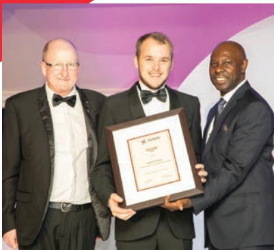
2019 SAIW Awards. ... Pg 3

SAIW Southern African Institute of Welding